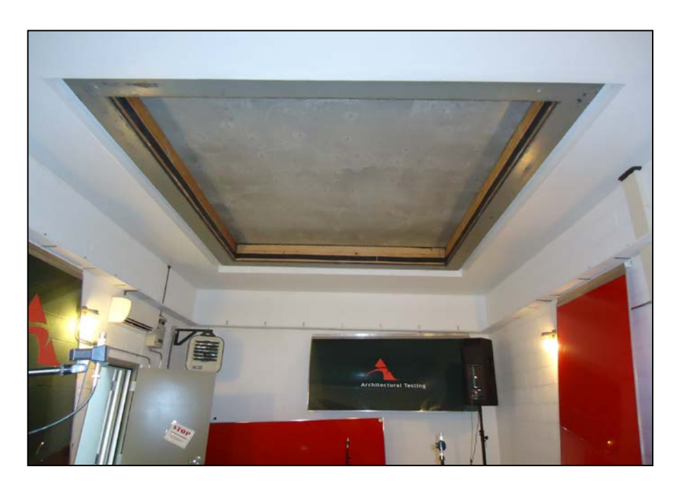
Receive Room View of Test Specimen Installation